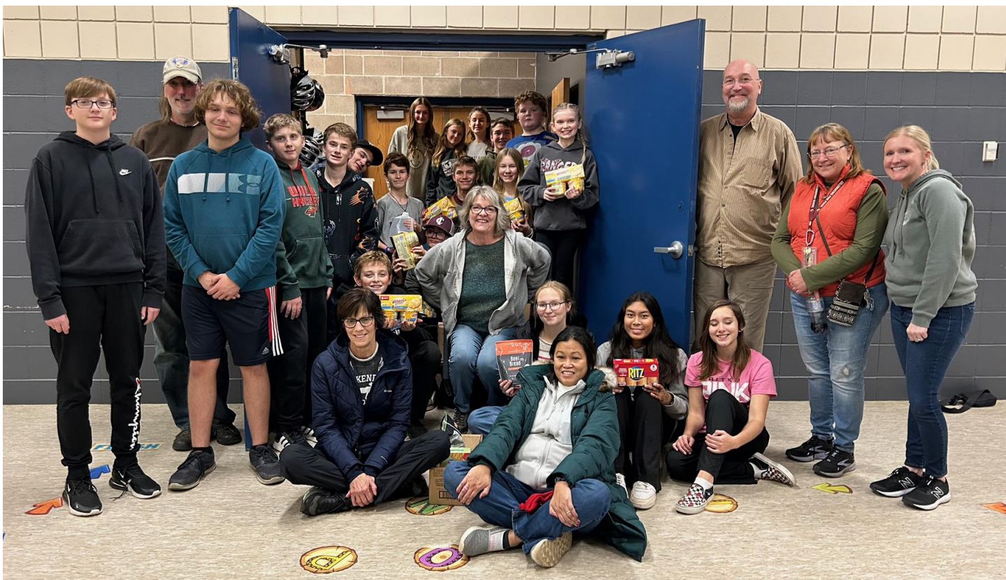
ILC Youth & Chaperones move food from the Cuyuna Range Food Shelf to CRES