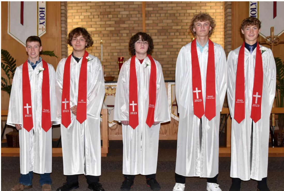
Confirmation Class 2023