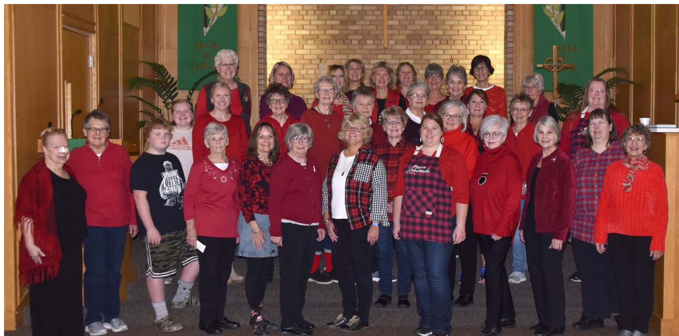
What a TEAM! The Spirit of Christmas Bazaar 2023